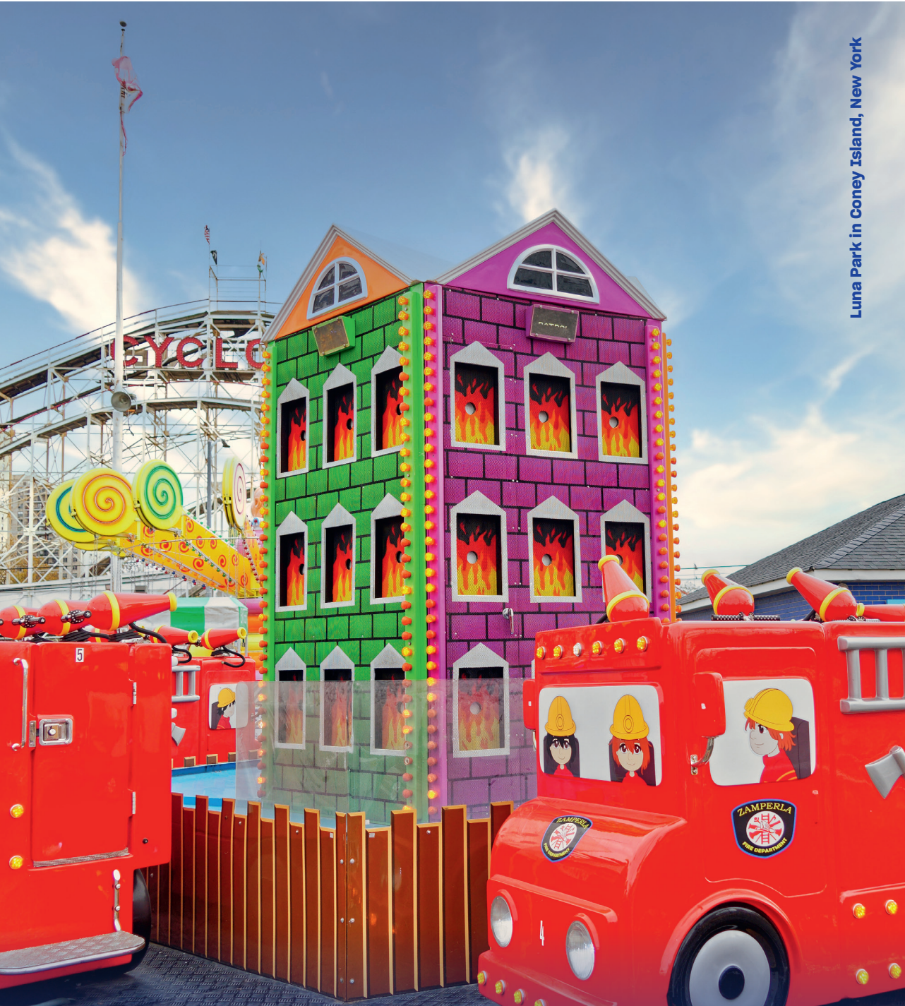
Luna Park in Coney Island, New York